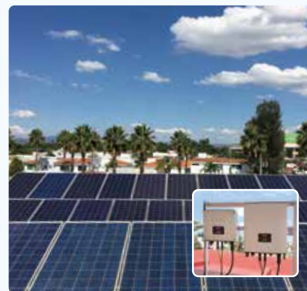
• Mexico 8KW