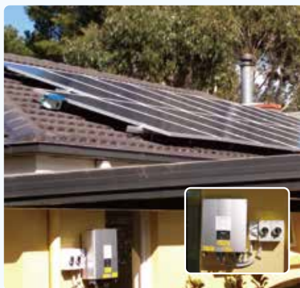
• Australia 5KW