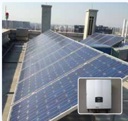
• Belgium 4KW